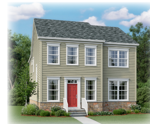
{ Eastern Seaboard - Stone Water Table }