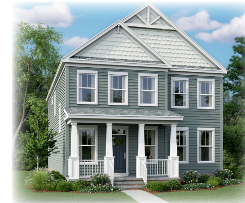
{ Craftsman - Stone to Grade }