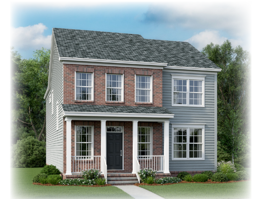
{ Eastern Seaboard - Full Brick, Full Porch }