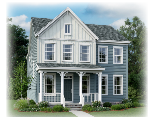
{ Farmhouse - Stone to Grade }

The Lexington is open and spacious with a design that has your family in mind. From the front door to the Family Foyer, the Main Level is completely open, allowing family gatherings to flow easily from one space to the next with ease. The Great Room and Dining Area, open to the expansive kitchen will delight the entertainer in your family. Hardwood Flooring is included on the Main Level in the Foyer, Great Room, Kitchen, and Dining Area. The oversized island can easily seat up to 6 people for casual dining or homework time, perfect for the busy family. The Family Foyer entrance from the attached garage includes a large Mud Room and Pantry and also offers two Optional configurations for a Tech Center or Laundry Room on the main floor. Upstairs The Master Bedroom and Bath and 3 generous sized additional Bedrooms are joined by a hall bath, loft area and laundry area. The Lower Level includes Options for finishing a Rec Room, Bath and Den. This home starts at 2318 sq. ft.