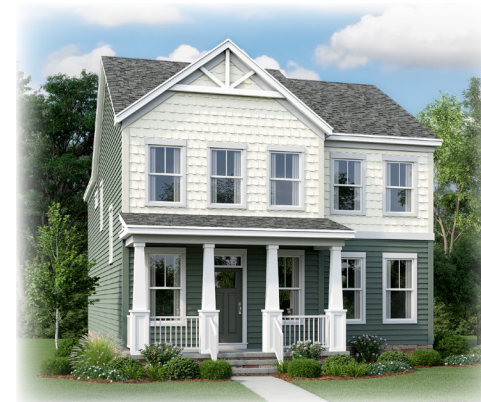
{ Cottage - Stone to Grade }