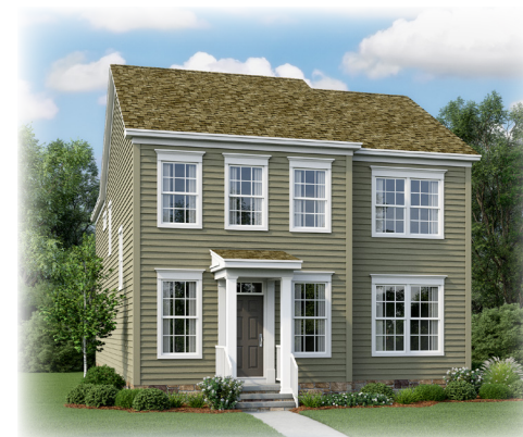
{ Eastern Seaboard - Portico - Stone to Grade }